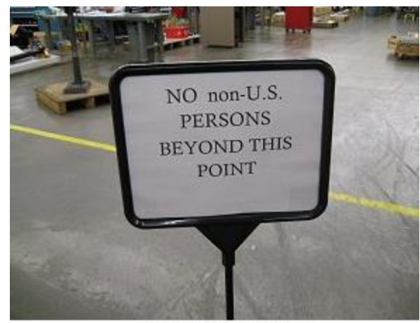
Temporary Access Sign

These signs indicated that export controlled work is underway within a work center. These signs are used in situations where it is not practical to make use of the cardboard barriers.